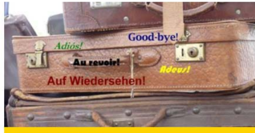
Departure and beyond