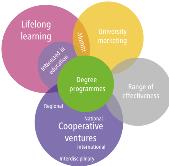
Figure 1: Transition to standard university curricula

Furthermore, it is possible to categorize the courses on their degree of integration in academic teaching. The following illustration shows an axis for time and an axis for the type of teaching unit. It distinguishes between MOOCs at course level, module level and degree course entry level. The time axis distinguishes between different target groups.